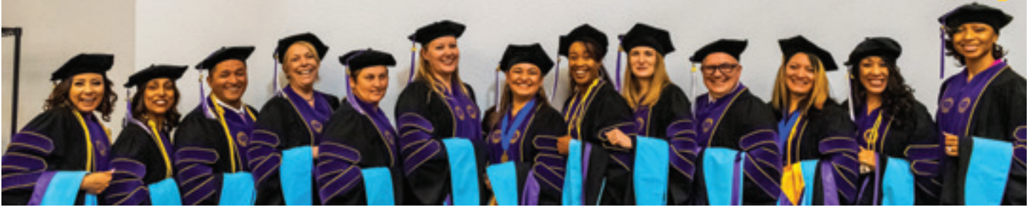
▲ First graduating EdD class