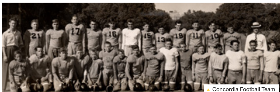
▲ Concordia Football Team