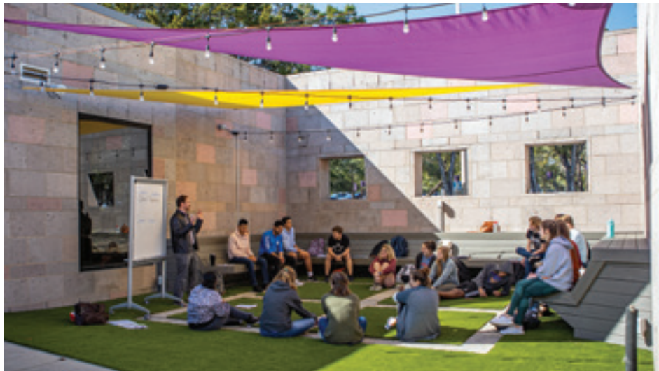
▲ New outdoor classrooms

Both classrooms are fully equipped, complete with dual bench seating, electrical outlets, Wi-Fi, purple and gold solar sails, and programmable party lights. The new learning spaces leverage one of Concordia's most unique features — the beautiful natural setting. All members of the Concordia community are invited to enjoy the spaces.