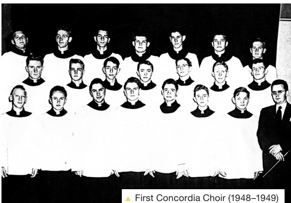
▲ First Concordia Choir (1948-1949)