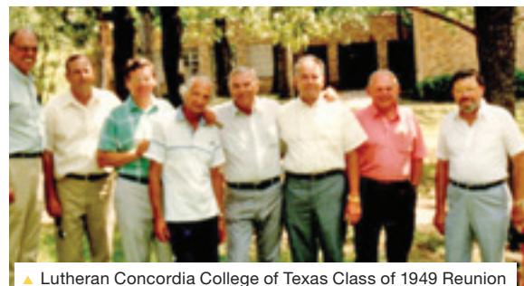
▲ Lutheran Concordia College of Texas Class of 1949 Reunion